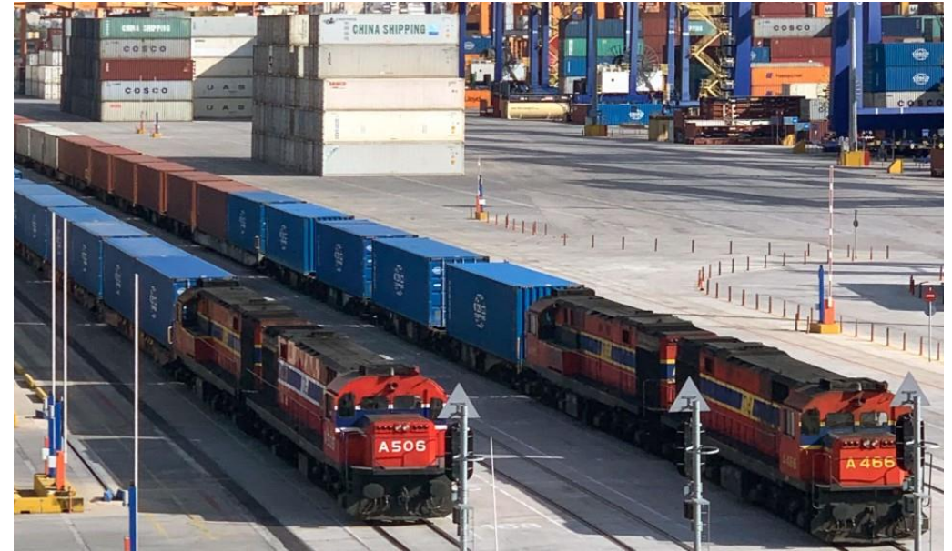
Port of Piraeus Rail Link